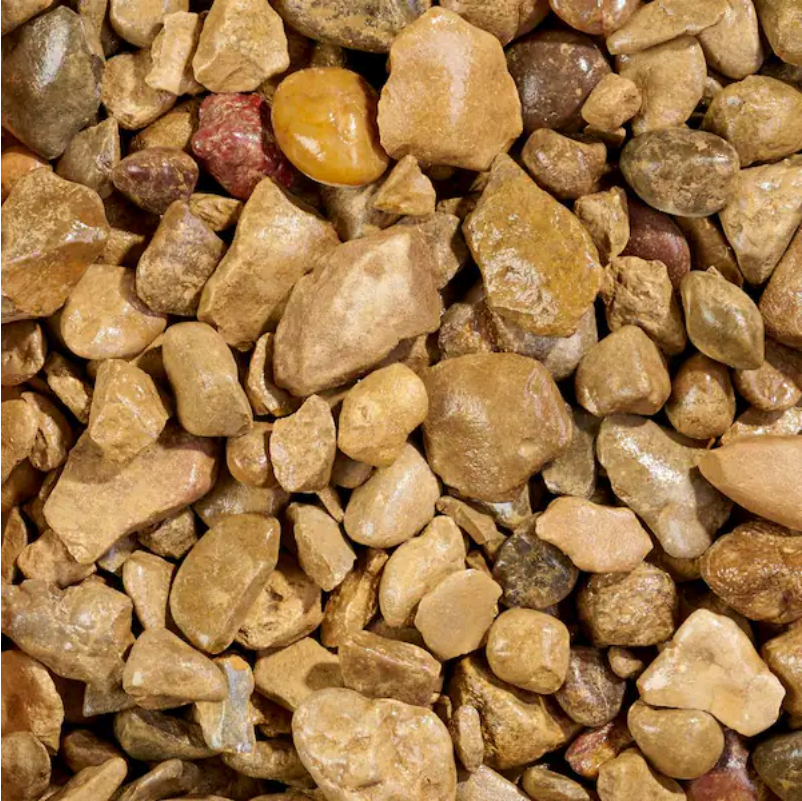
Hover Image to Zoom