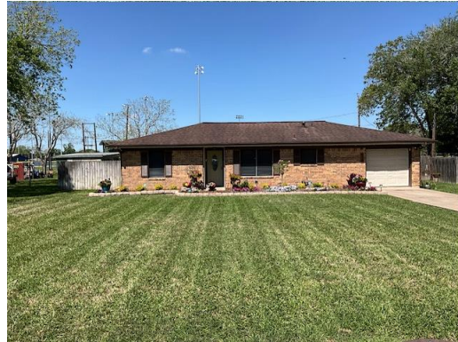
805 Lilly Ave.