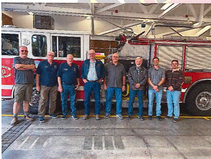
2024 Retiree Spring Dinner