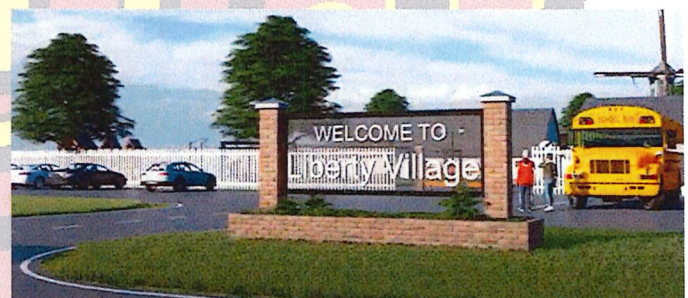
Liberty Village PowerPoint Presentation