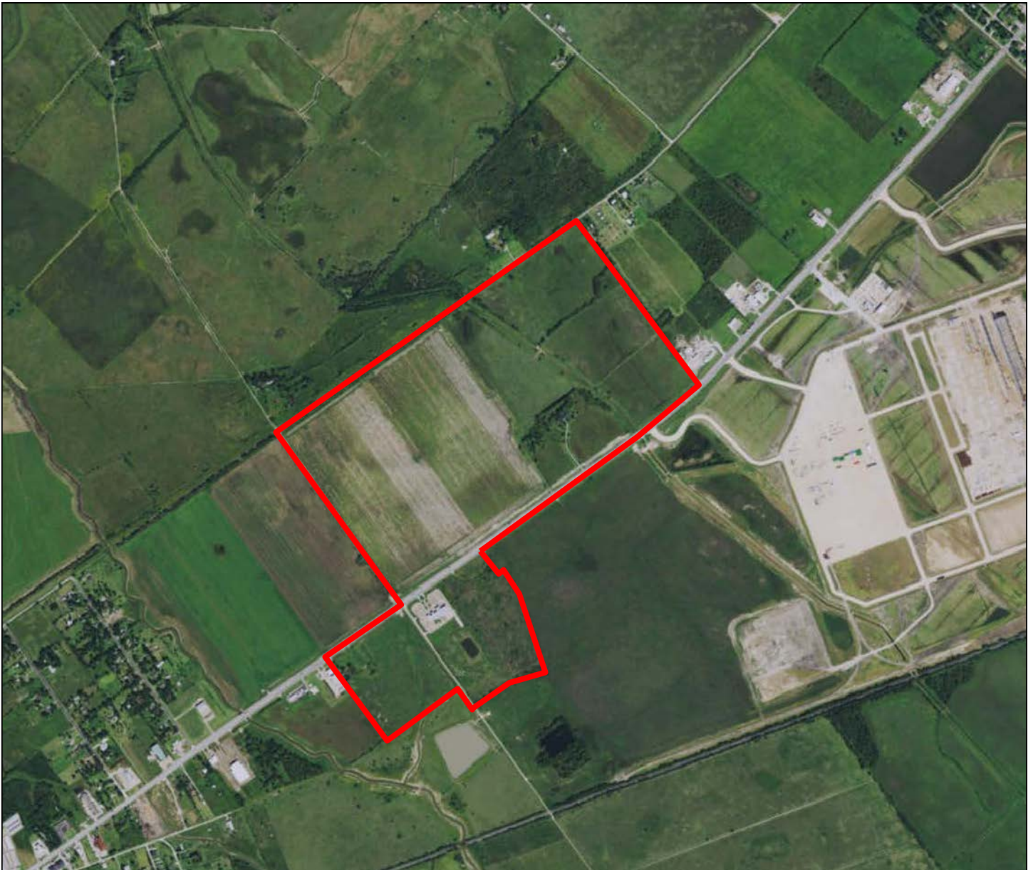
*TIRZ #2 Boundary

The majority of the property within TIRZ #2 is currently vacant. The purpose of TIRZ #2 is to help pay for infrastructure costs associated with the development of a large mixed-use development totaling more than 2,200,000 square feet of new construction. It is expected to facilitate the construction of both residential and commercial development.