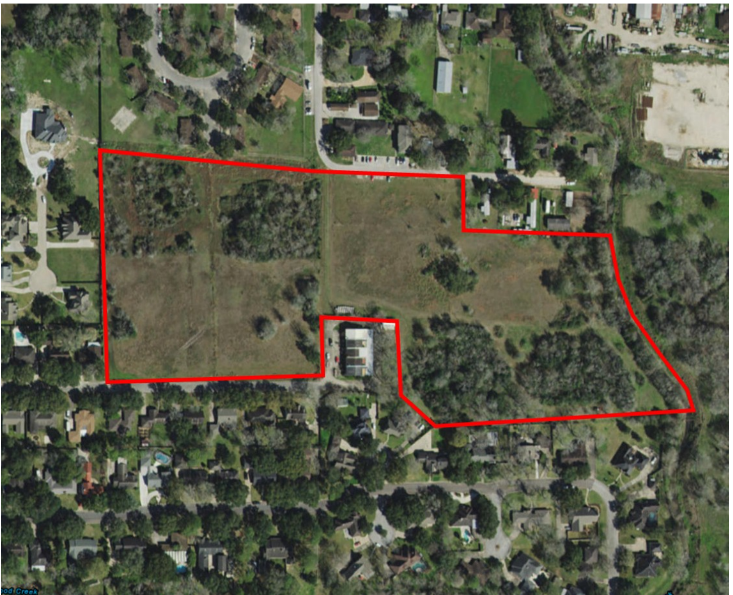
*TIRZ #3 Boundary

All real property within the boundaries is underdeveloped and the sidewalks and street layout are inadequate. As such, the site will not be developed to its full potential but for the creation of a TIRZ.