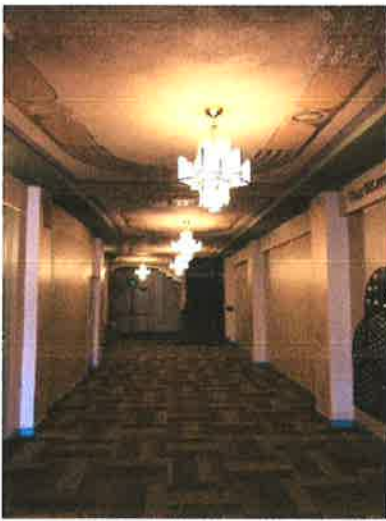
Upgraded downstairs lobby Mezzanine upgrade will mirror downstairs