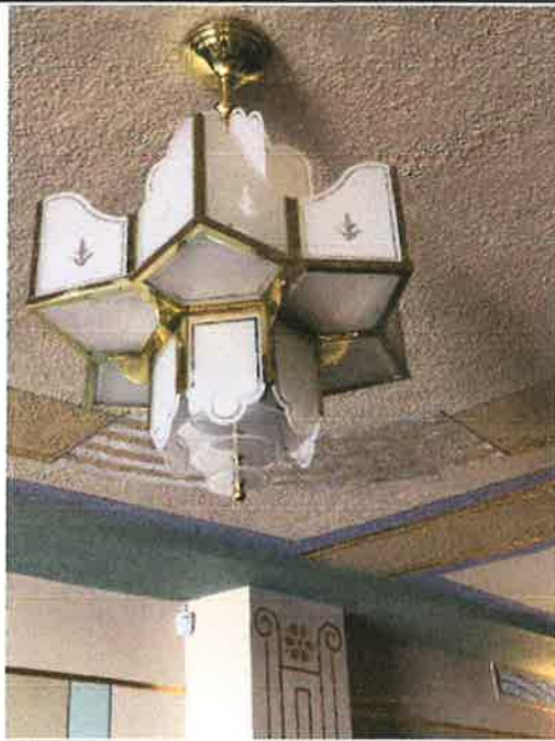
Decorative painting details in downstairs lobby to be replicated in the Mezzanine