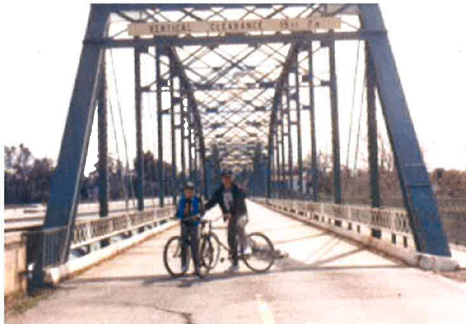
Historic Table Mountain (AKA Upper Thermalito) Bridge over the Feather River