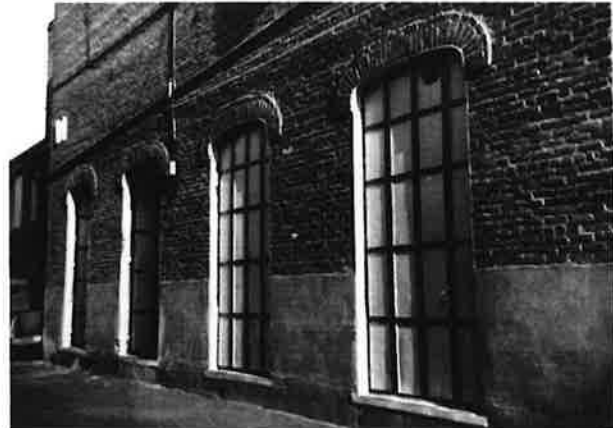
Twentieth-Century Miners Alley Views: