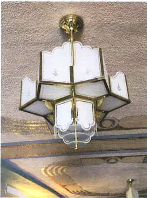
Chandelier replications. Member donation purchased 5 chandeliers for the Mezzanine in anticipation of the complete upgrade

NOTE: COMPLETE ITEMS (6-8) ONLY IF THEY ARE APPLICABLE TO YOUR REQUEST