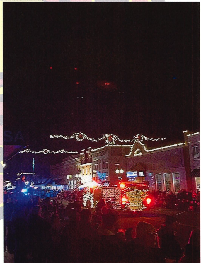
Lighted Parade best fire engine entry!!!

Average Turnout Time = 1:30 (1:31) Average Response Time = 4:47 (4:30) Average Time on Scene = 20:12 (17:19) Average Transport Time = 24:05 (26:48) Average at Hospital Time = 25:45 (21:53)