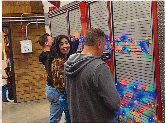
Family pizza night decorating E-7502

Overtime = 400 (344) Part-time = 197 (395) Volunteer = 18 (29)