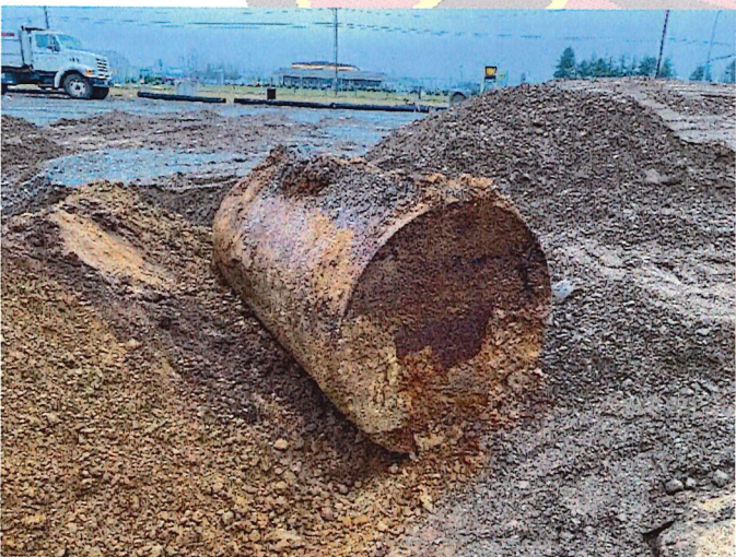
Fuel tank inspection new Shell station discovery