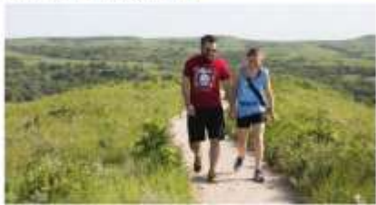
unpaved nature trail