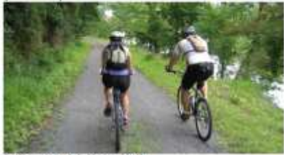
hike and bike trail