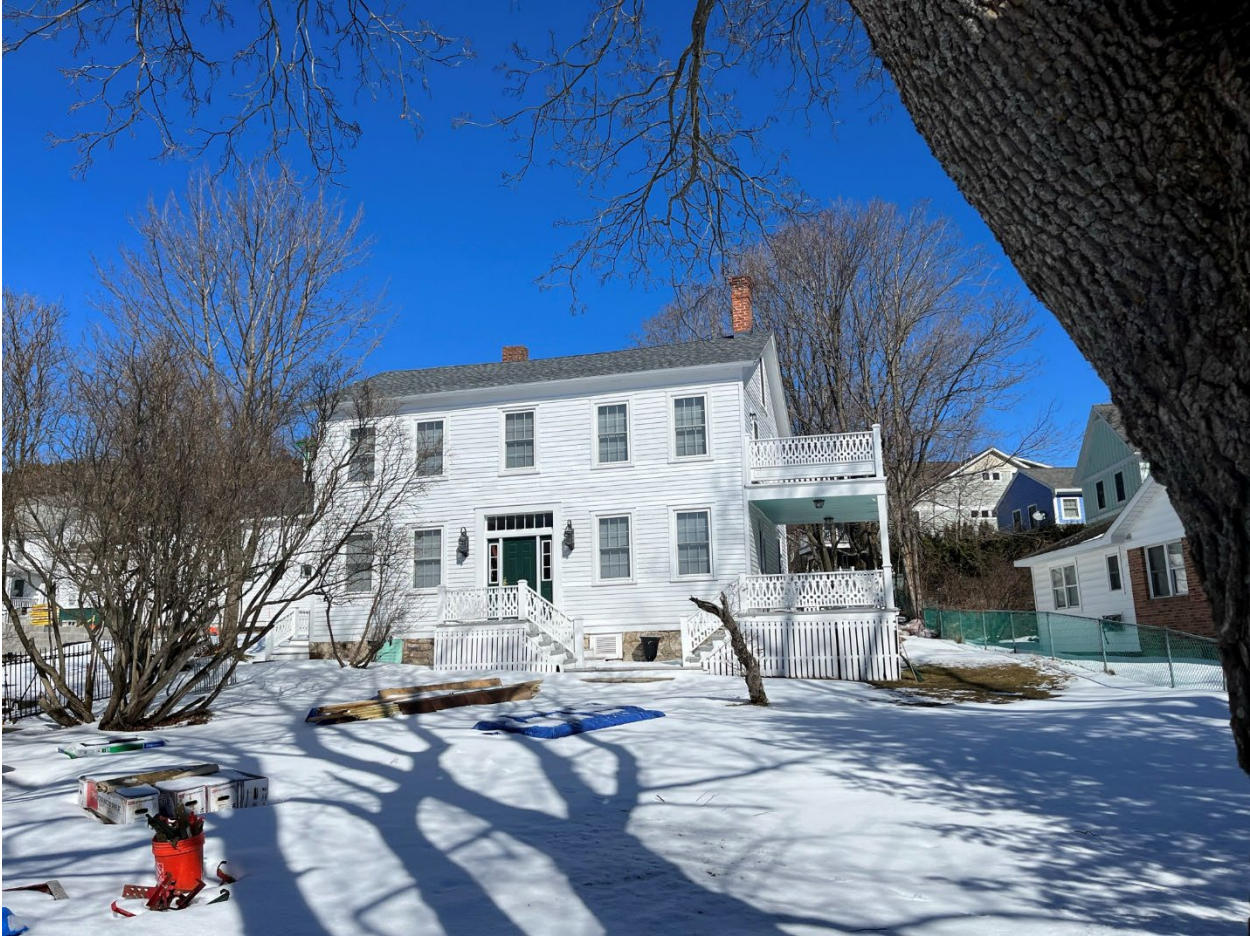
Photo 8. Jacob Wendell House, 6734 Main Street