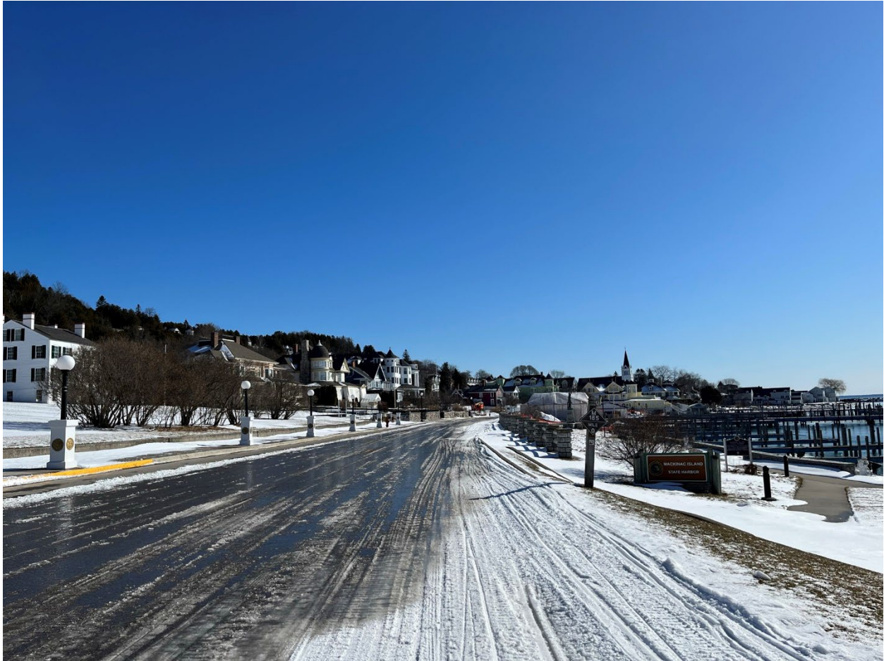
Photo 1. Looking East down Main toward the Mission District

PHOTOGRAPHS March 2023 All photographs taken by Jennifer Metz