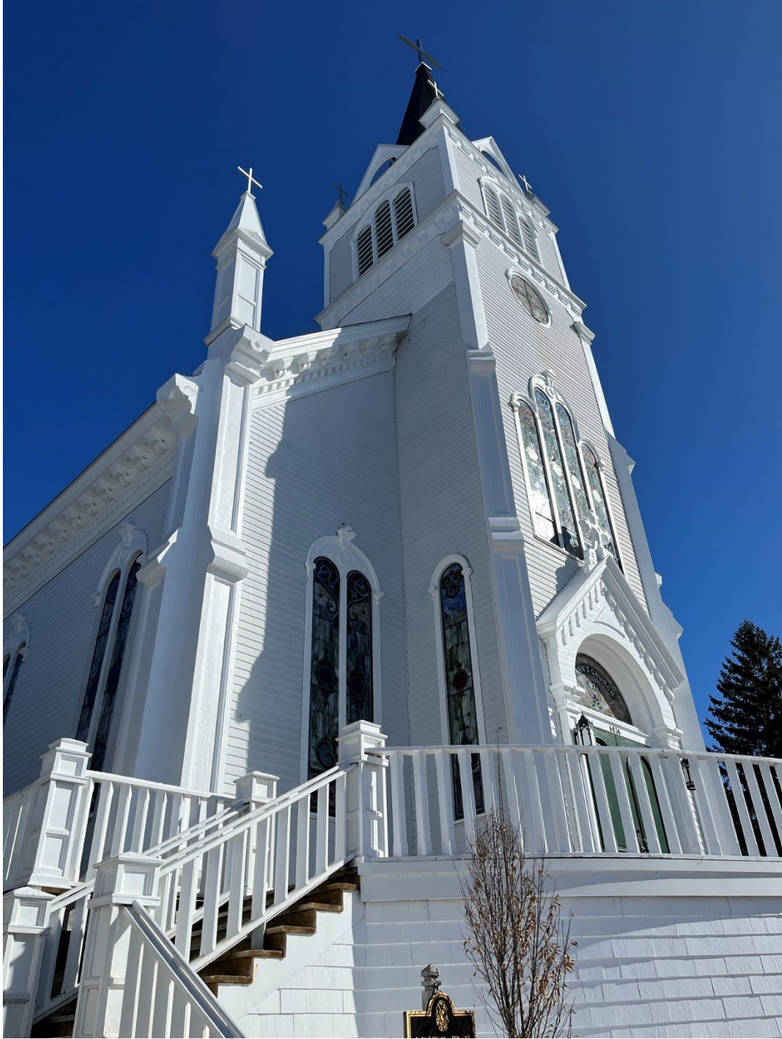
Photo 4. Saint Anne's Church, 6836 Main Street