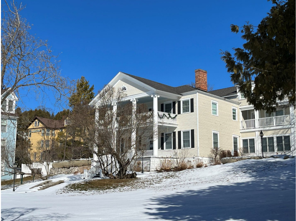
Photo 6. Harbour View Inn, formerly Madame Laframboise House, 6860 Main Street