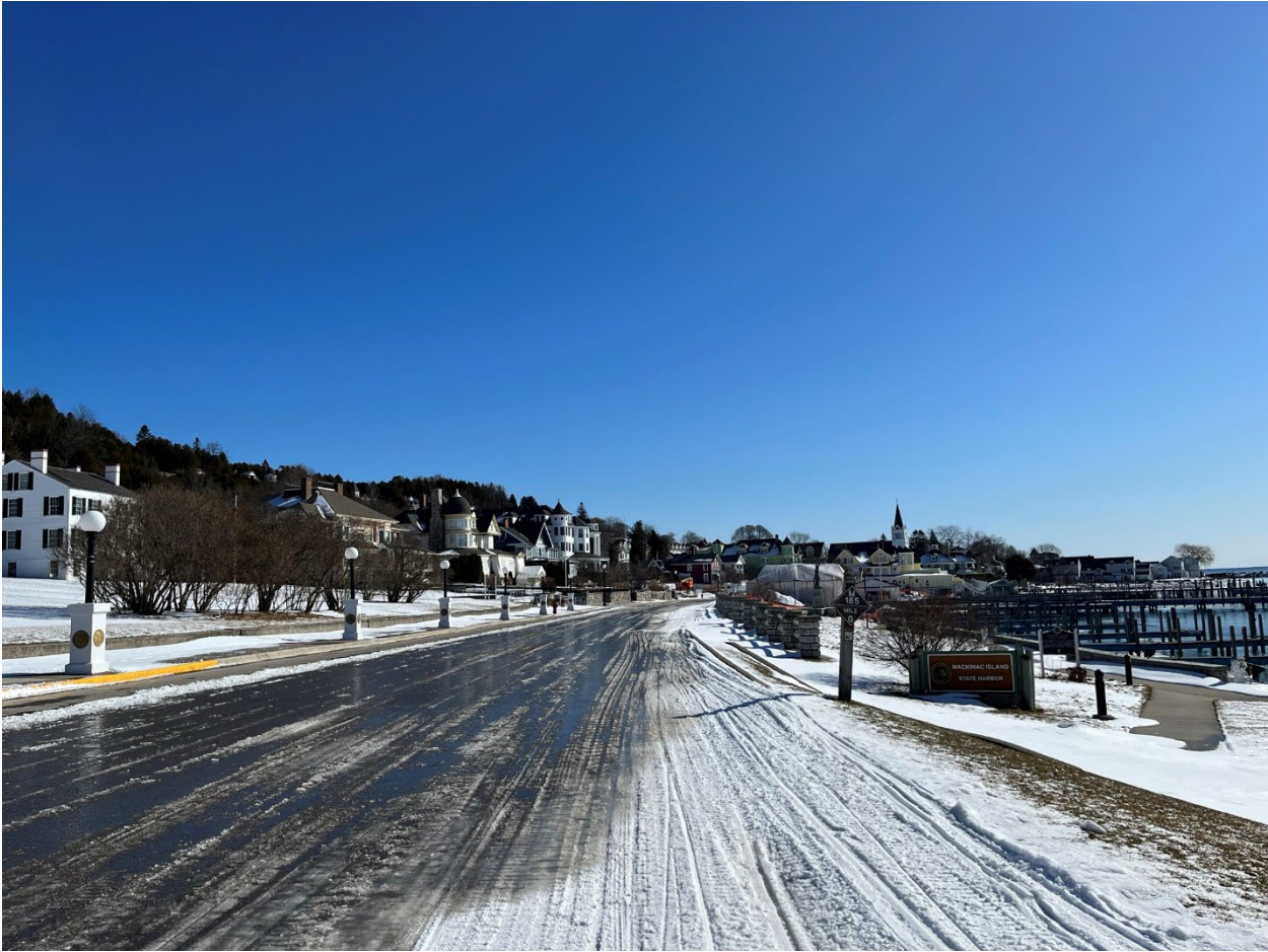
Photo 1. Looking East down Main toward the Mission District

PHOTOGRAPHS March 2023