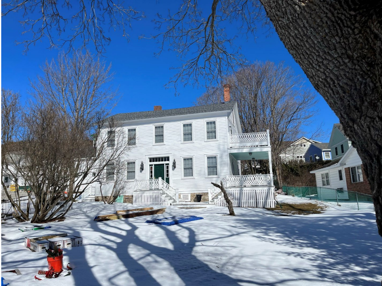
Photo 8. Jacob Wendell House, 6734 Main Street