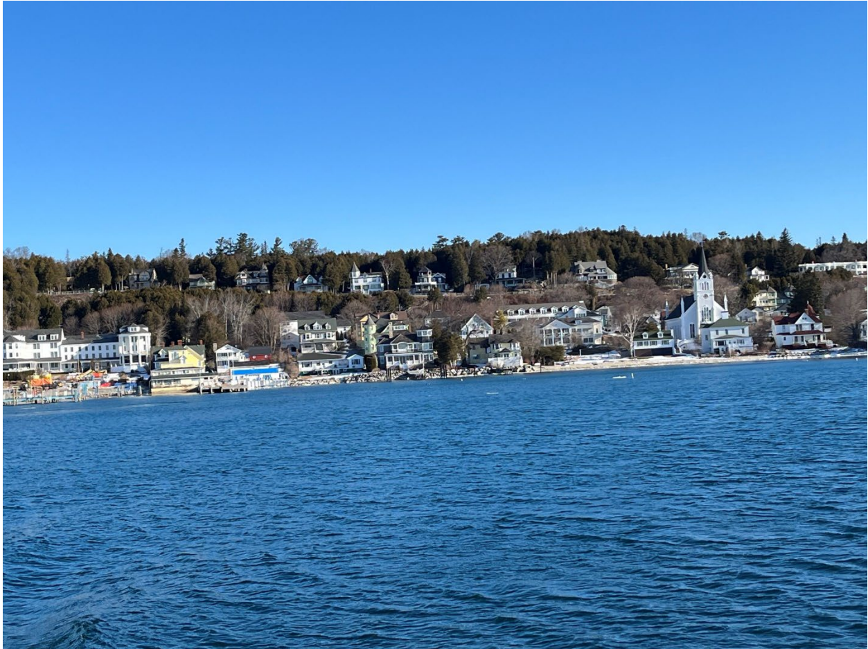
Photo 11 – The east end of Mackinac Island and Mission District from the bay.