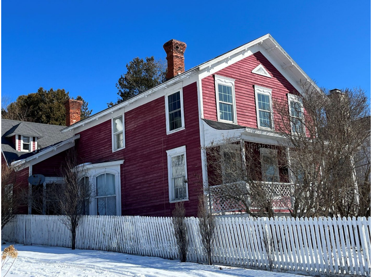
Photo 2. 6948 Main Street, c. 1850.