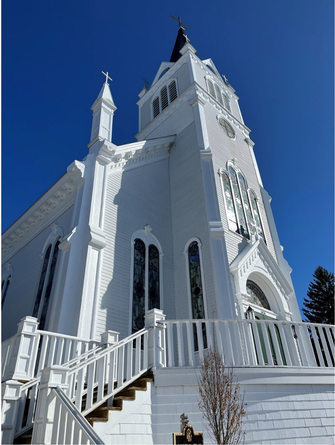
Photo 4. Saint Anne's Church, 6836 Main Street