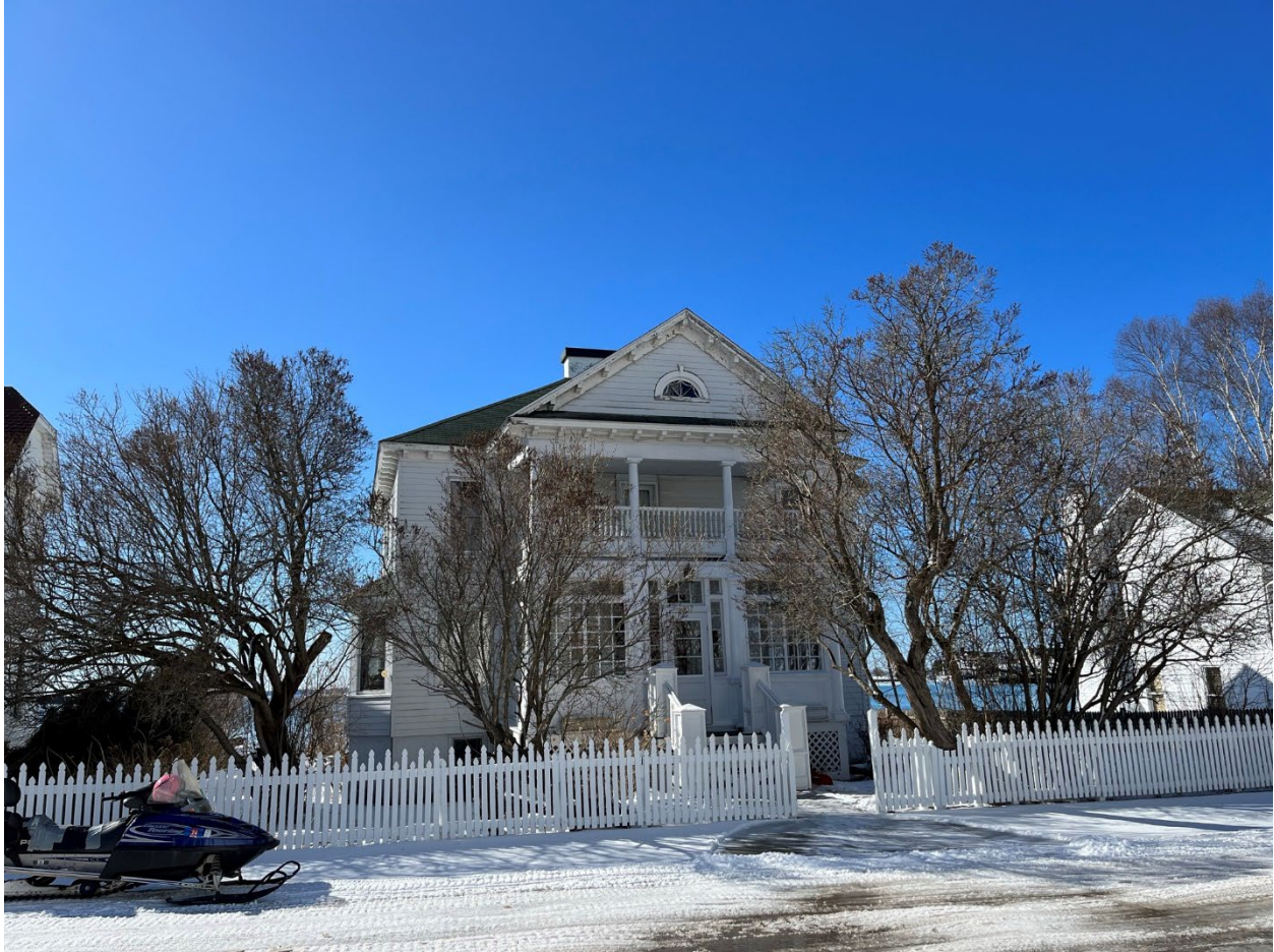
Photo 5. Saint Anne's Rectory, 6837 Main Street