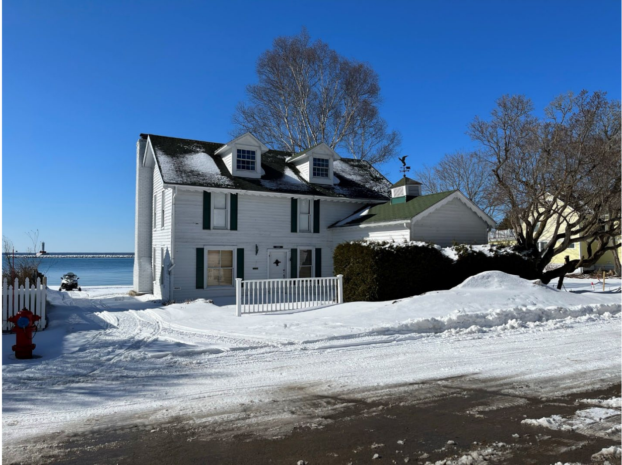
6849 Main Street.