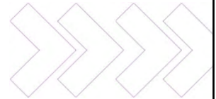
Street banner concepts