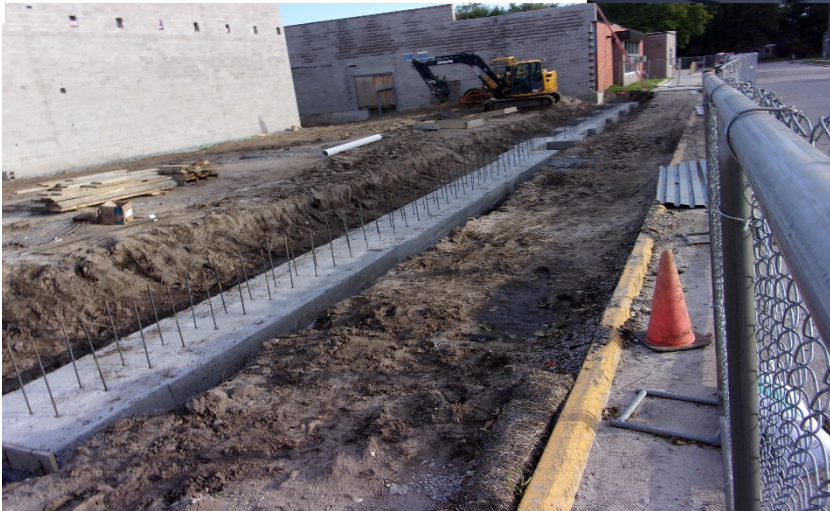
North Cedar School new addition