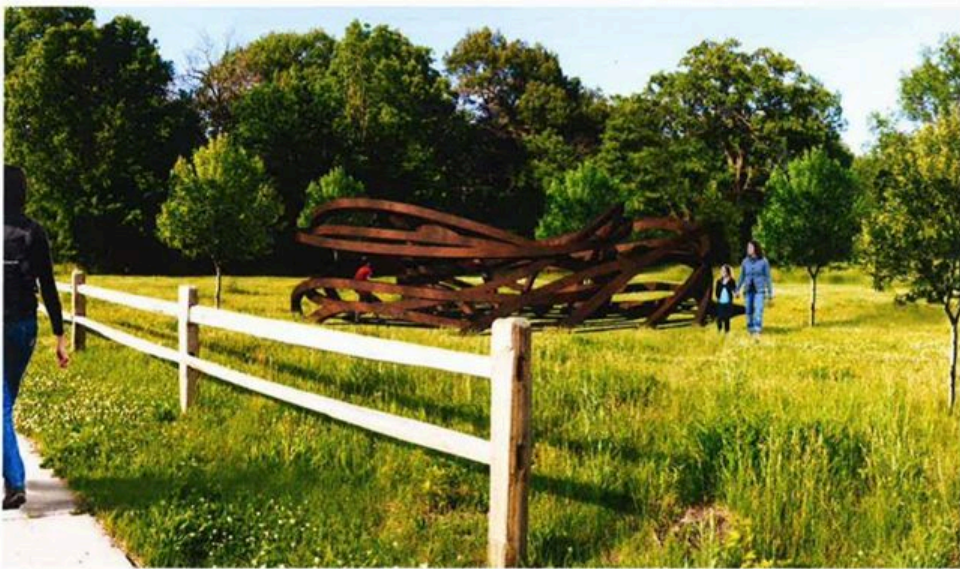
Public art : Nest, Tommy Reife