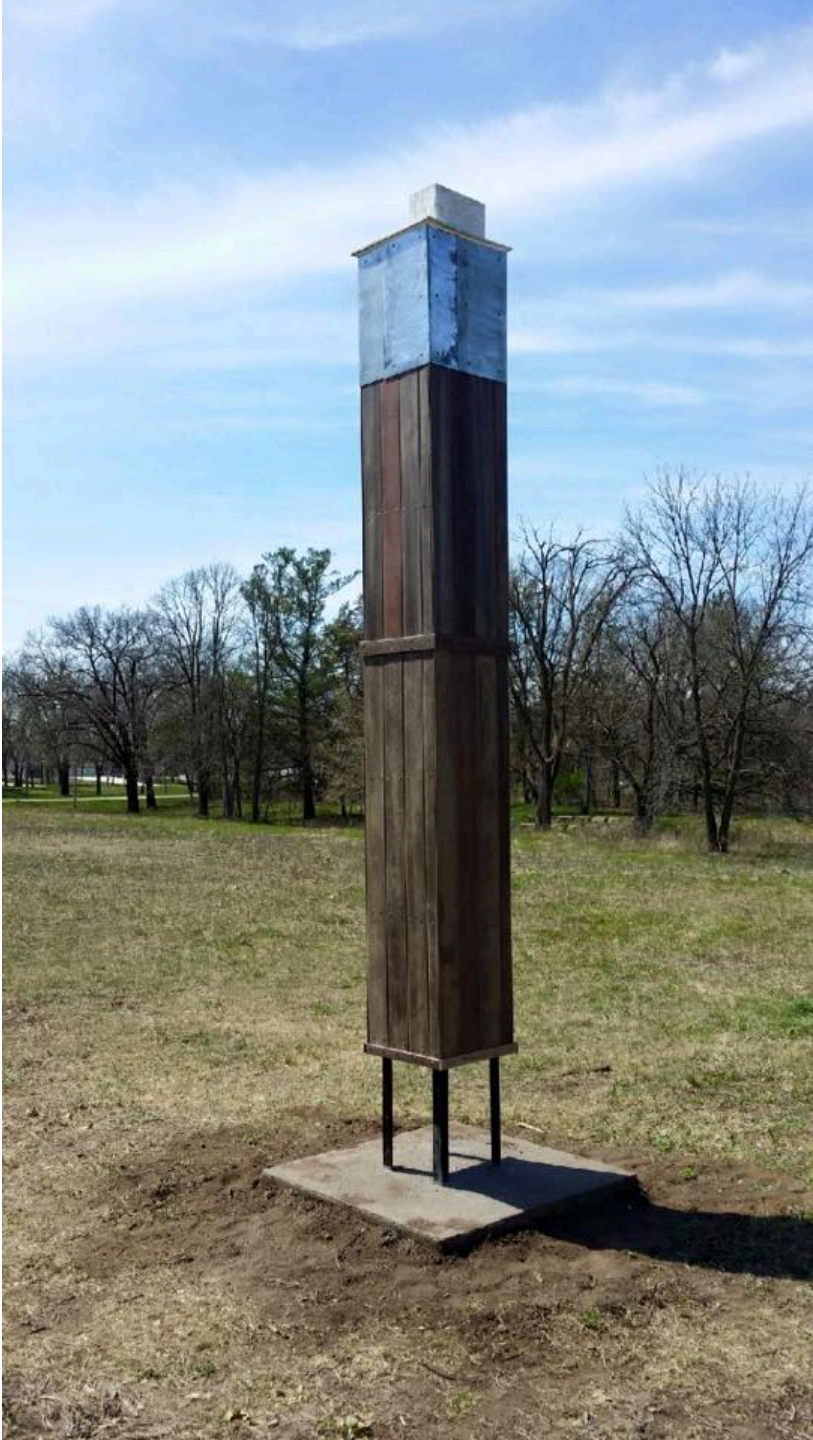
Chimney swift house