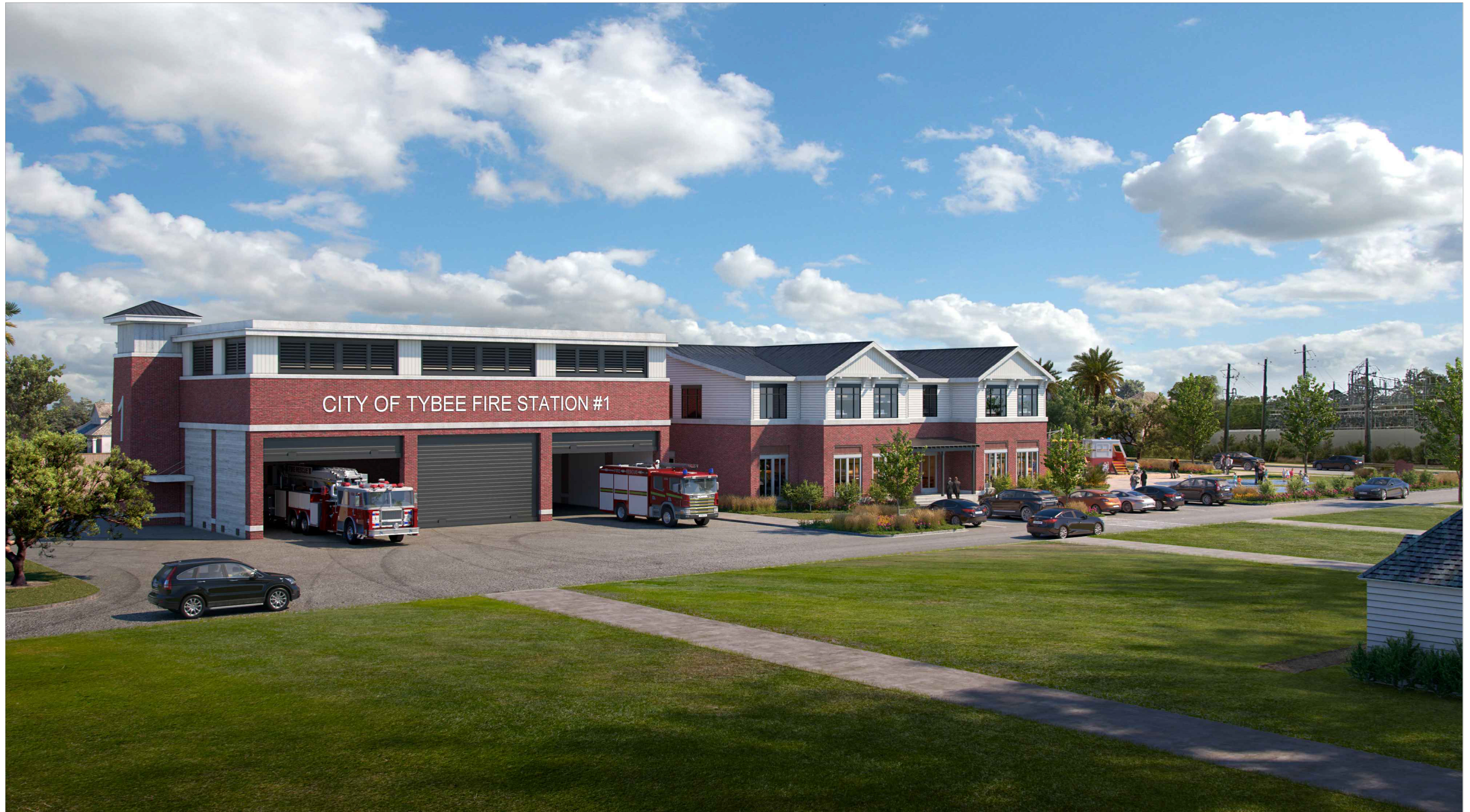
PERSPECTIVE LOOKING SOUTH-EAST AT JONES AVE. AND 5TH ST. SCALE: N.T.S.