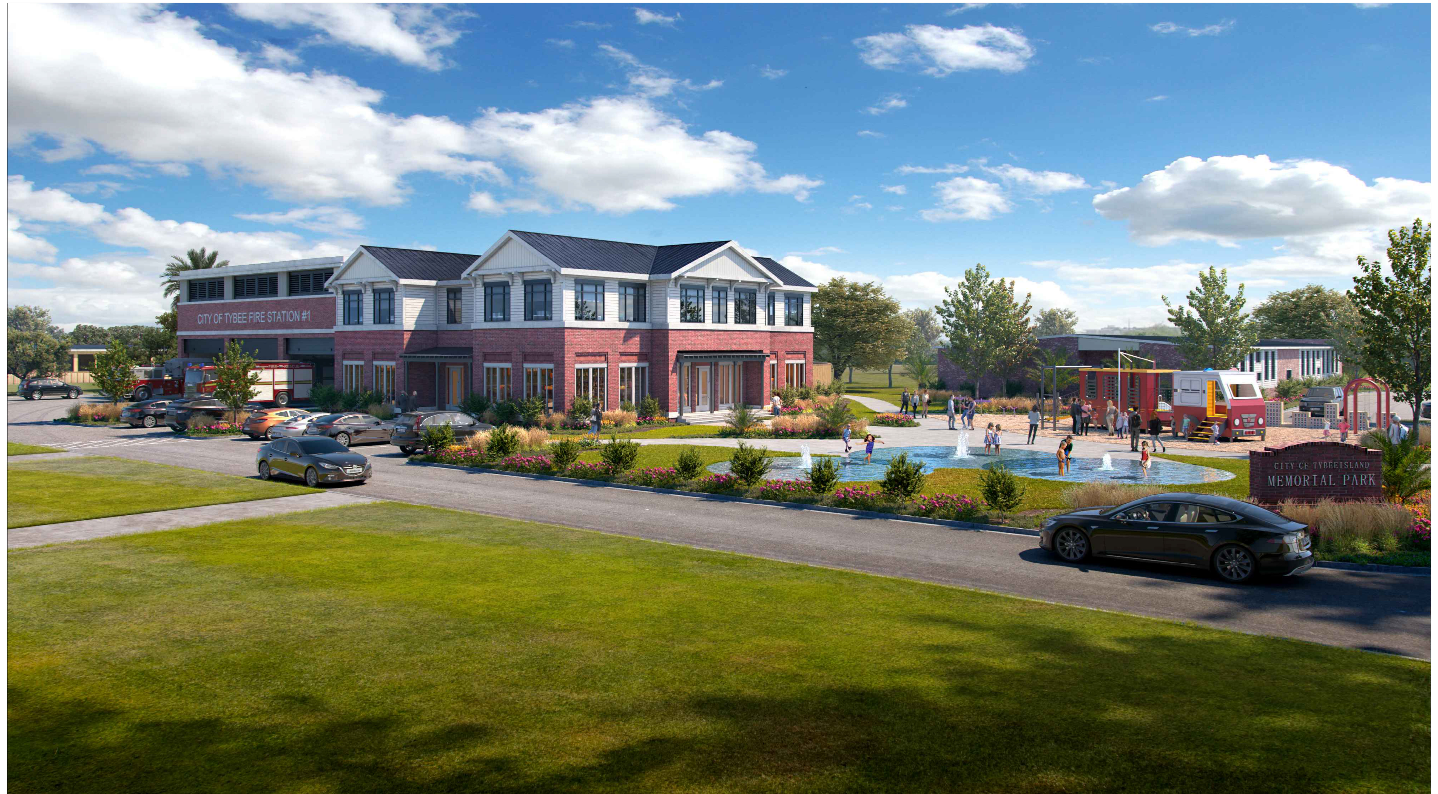
PERSPECTIVE LOOKING NORTH-EAST AT JONES AVE. AND 5TH ST. SCALE: N.T.S.