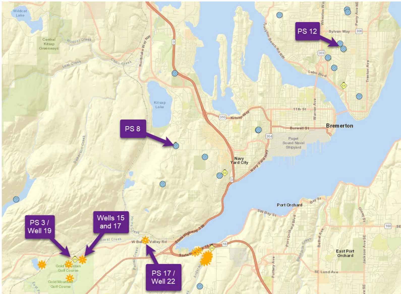
LOCATION MAP – MULTIPLE SITES FOR EMERGENCY POWER GENERATION EQUIPMENT