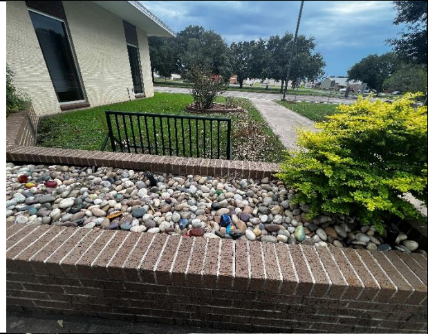
Library Rock Garden